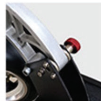
FOLD THE LATCH