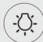
Lighting the lights