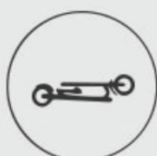
Fold in 3 seconds