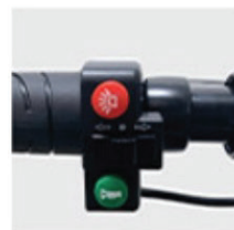
HORN/ L & R TURN LIGHTS/ HEADLIGHTS & RUNNING LIGHTS