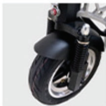
10" PNEUMATIC TYRE