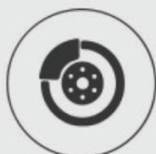
Double brake system